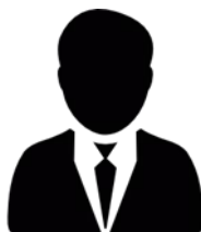
Secretary, District Legal Services Authority MEMBER