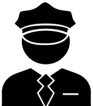
District Superintendent of Police MEMBER