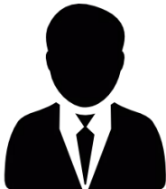
District Magistrate MEMBER