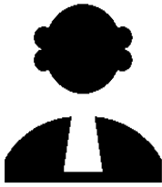
District & Sessions Judge CHAIRPERSON